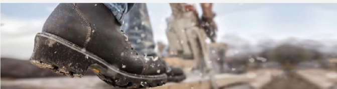
Steel toed boots

Personal protective equipment — or PPE — is equipment worn to minimize exposure to a variety of hazards. The following items of PPE should be properly used at each installation: