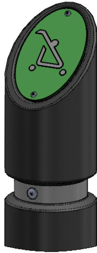
Signage options available