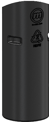
Branding and recycling details